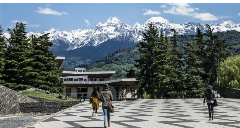
CAMPUS DE GRENOBLE