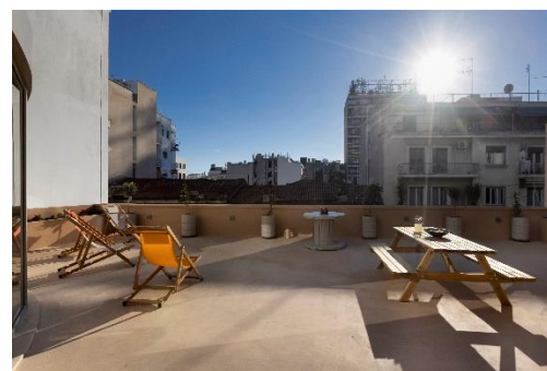
Common Use Roof Terrace

Finally, all rooms benefit from access to the Roof Terrace area – an area to read or simply relax and enjoy the Athens sunshine (on average > 300 days p.a.)