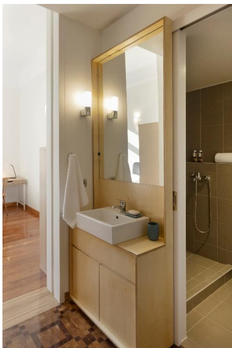
All rooms are ensuite

Each room benefits from its own exclusive use of a fridge in the kitchen area (1 common kitchen per floor), while the kitchen is fully equipped with the availability of a dining table and six chairs.