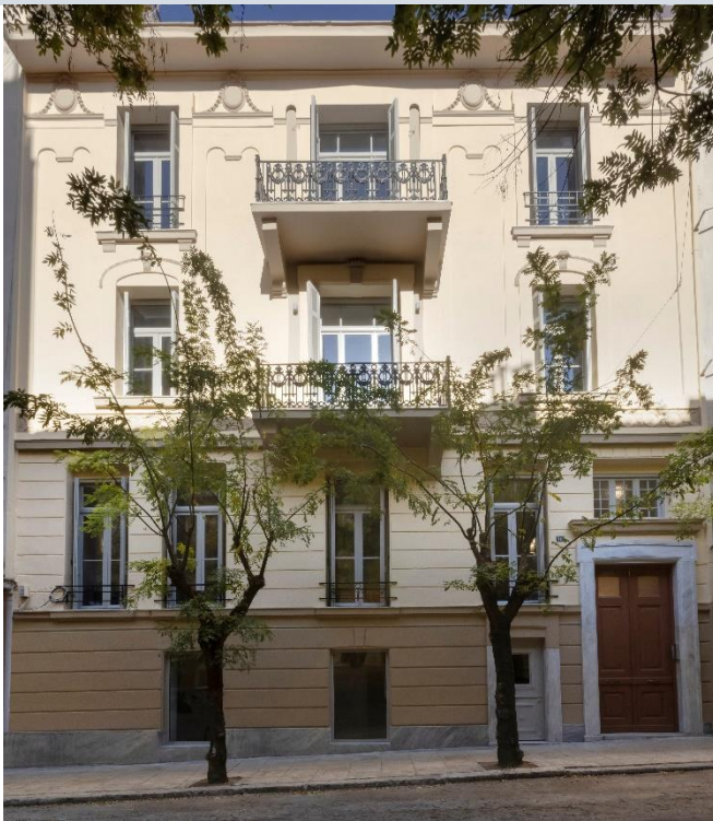
Picture of the building