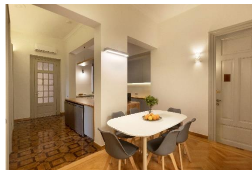
1 common Kitchen Area per floor

Each room benefits from its own exclusive use of a fridge in the kitchen area (1 common kitchen per floor), while the kitchen is fully equipped with the availability of a dining table and six chairs.